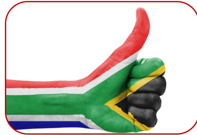
Unless specifically permitted Trade Union Membership / Political opinions