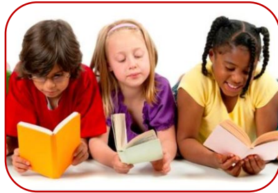
Personal Information of Children under 18