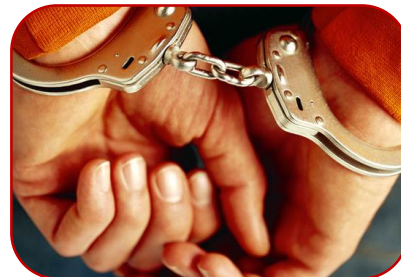
Unless specifically permitted Criminal Behavior