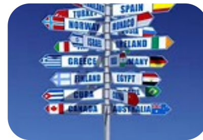
Unless specifically permitted Transfer Across SA Borders