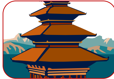
Unless specifically permitted Religious / Philosophical beliefs