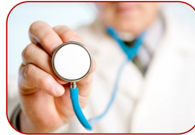
Unless specifically permitted Health, sexual life or biometric details