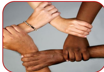
Unless specifically permitted Race or Ethnic origin